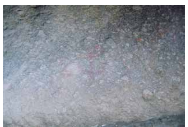
fig. 19 fig. 20