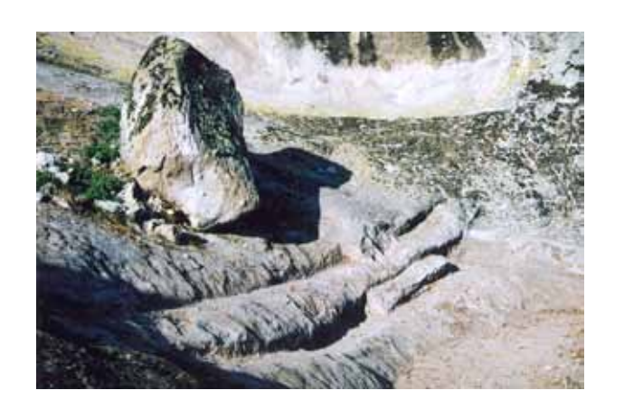
fig. 1 fig. 2