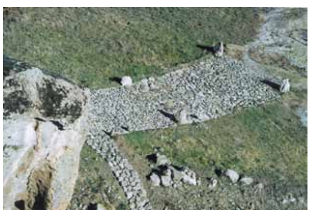
fig. 11 fig. 12