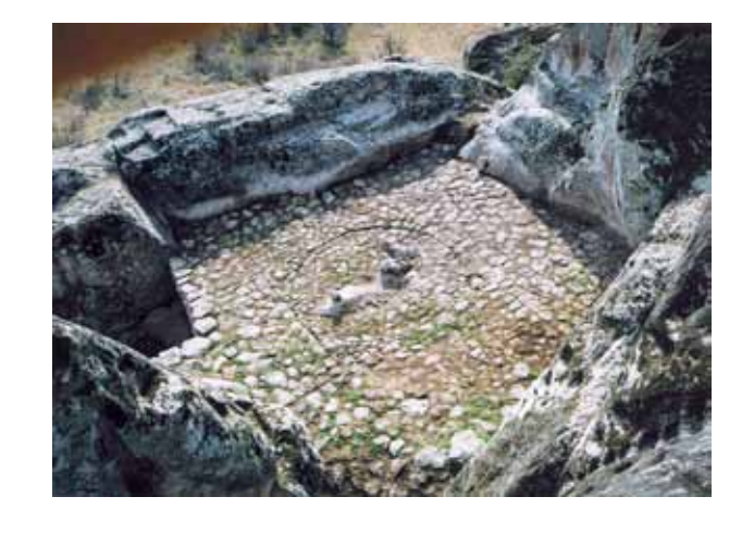
fig. 13 fig. 14