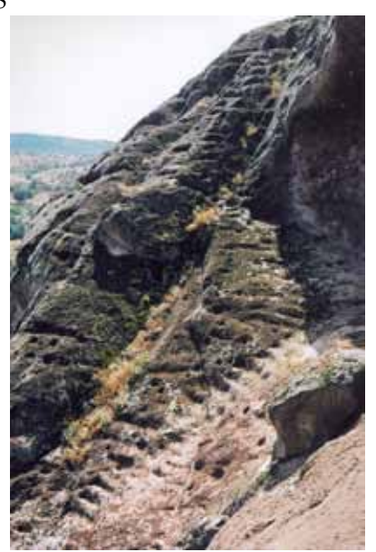
fig. 9 fig. 10