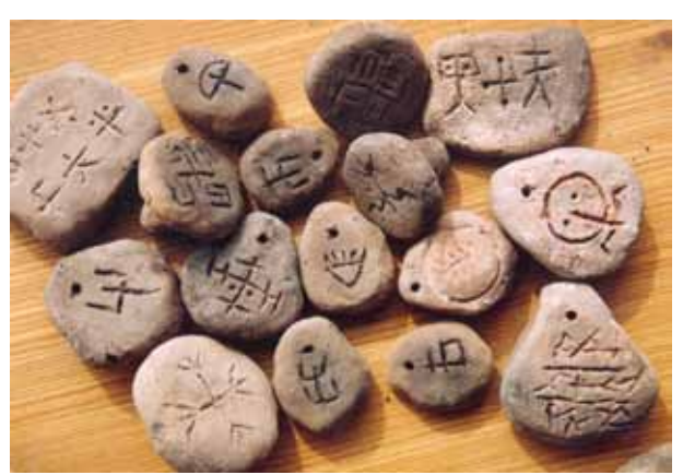
fig. 21 fig. 22