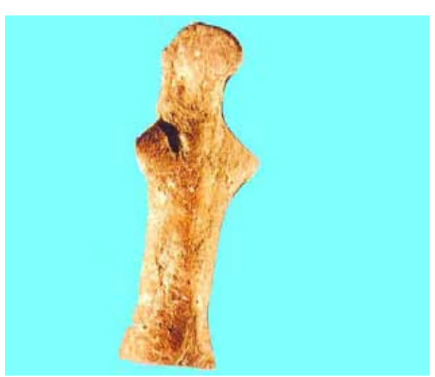
fig. 23 fig. 24