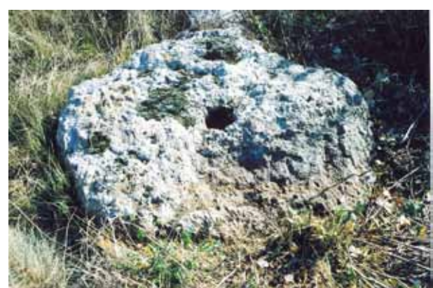
fig. 31 fig. 32